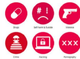
A Parent's Guide to Privacy Settings

Online safety is when young people know who they can tell if they feel upset by something that has happened online.