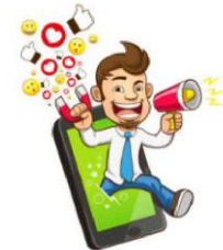
A Parent's Guide to Live Streaming