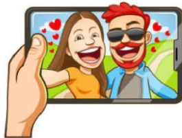
A Parent's Guide to Sharing Pictures