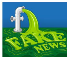
A Parent's Guide to Fake News